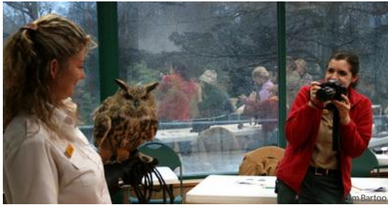
SLR I Class, January 20, 2010